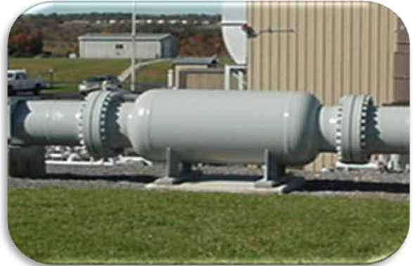
Inline Silencers installed at station